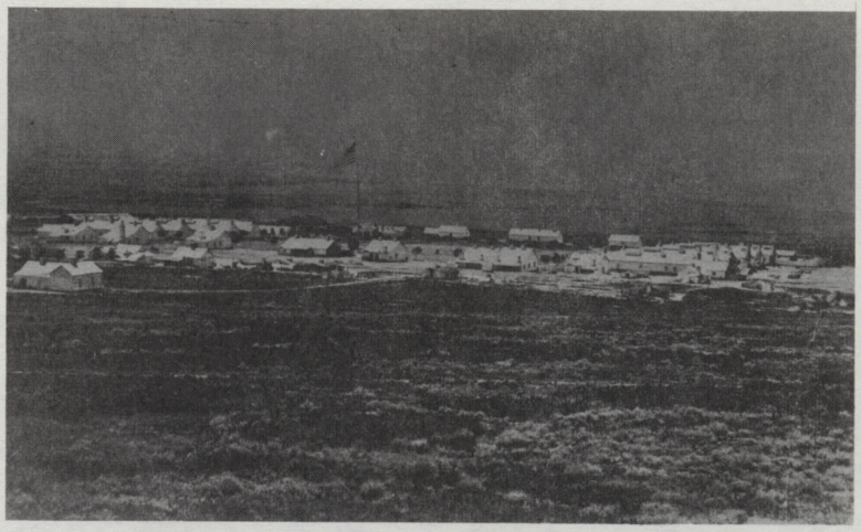
Looking southwest at Old Camp Douglas in 1868.

Some Mormon leaders predicted the rapid demise and early departure of the California boys, but in the meantime, Connor prepared for the duration. With months slipping by, and no apparent departure in sight, the saints were not long in perceiving that Uncle Sam's soldiers could contribute in a direct way to the city's economy, particularly when the paymaster made one of his infrequent visits. Newspapers of the time re-